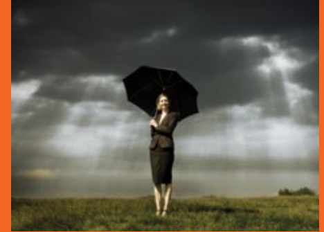
INSURANCE & BANKING